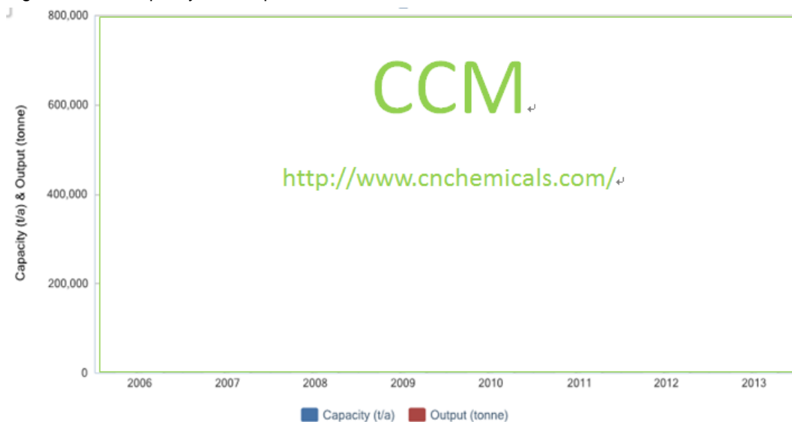
Figure 4.2.1-1 Capacity and output of HCFC-22 in China, 2006-2013