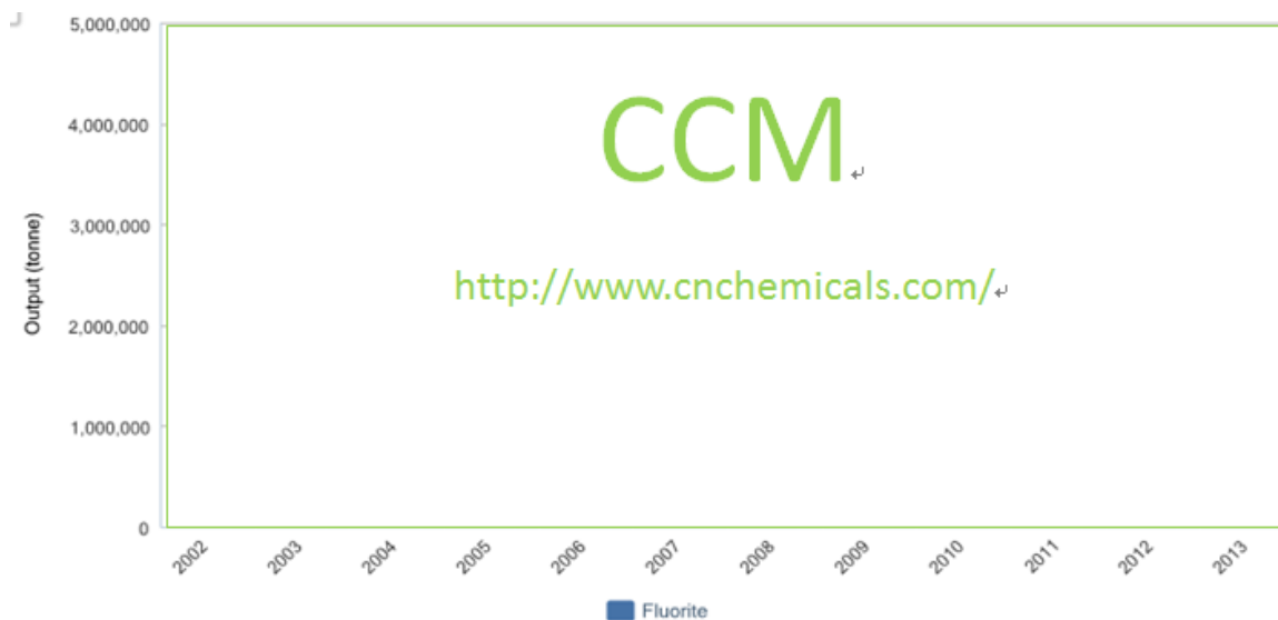
Figure 2.2-1 Output of fluorite in China, 2002-2013